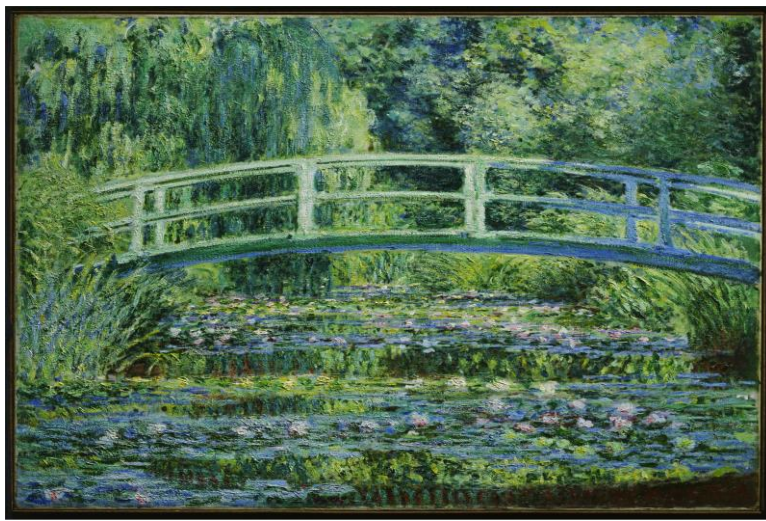
The Water Lily Pond – 1899