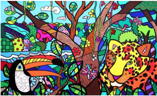
'Paradise for Sale' by Romero Britto