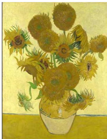
Sunflowers – 1888