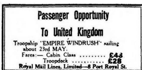
from the Kingston Gleaner (The Daily Gleaner)

Harriet Tubman (1822-1913) – born into slavery in Maryland, Harriet managed to escape and journey north on the Underground Railroad. She helped others to escape slavery.