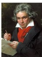
Beethoven: Piano Sonata No 8