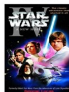
John Williams: 'Main Title' from Star Wars