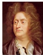
Henry Purcell: Music for a While