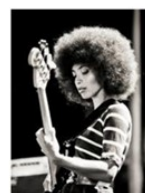
Esperanza Spalding: Samba em Preludio