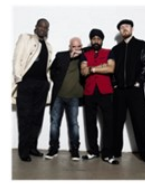
Afro Celt Sound System: Release