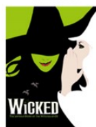
Stephen Schwartz: 'Defying Gravity'