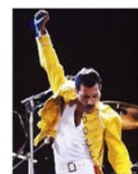
Queen: Killer Queen