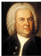
JS Bach: Brandenburg Concerto No 5