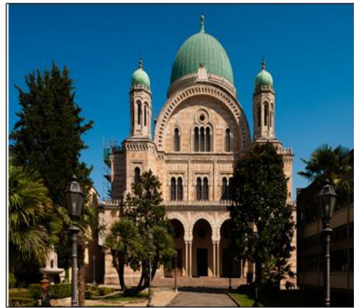
Image of the Great Synagogue of Florence, in Italy, Europe.

The main holy book of Judaism is the Torah , written in Hebrew . Synagogues are Jewish worship buildings.