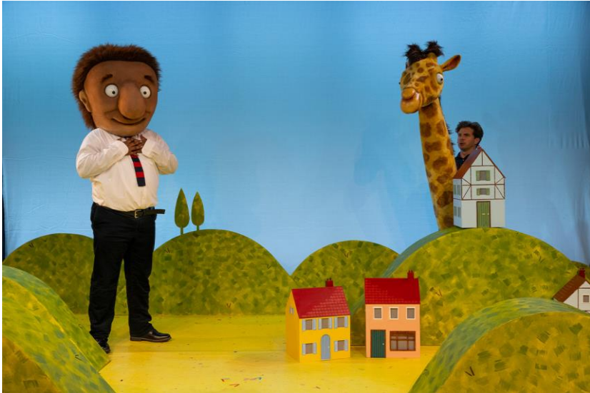
Smartest Giant In Town - Theatre Trip