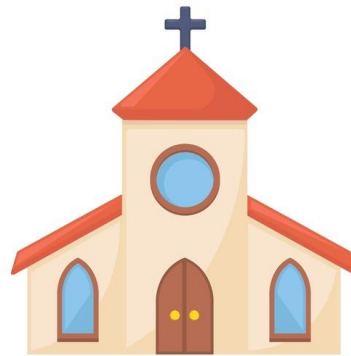
Visit to the local church as part of our RE lessons