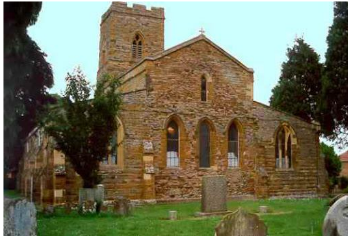
St Luke's Church