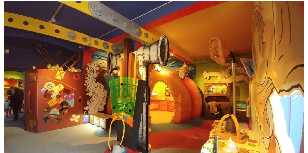
The Roald Dahl Children's Gallery