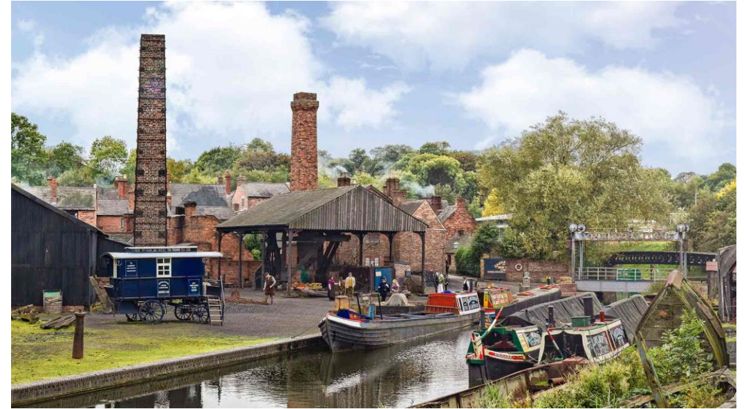
Black Country Living Museum