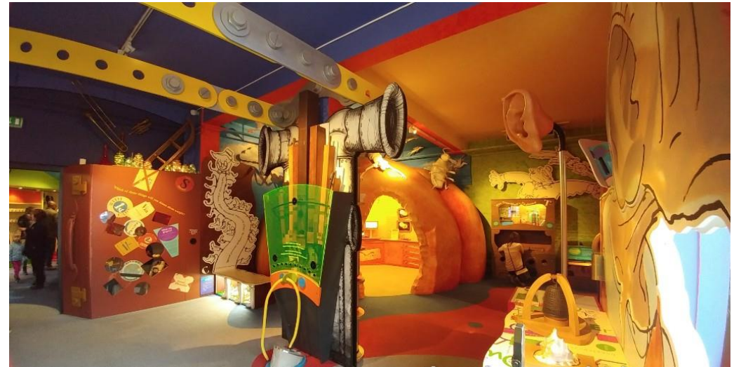
The Roald Dahl Children's Gallery